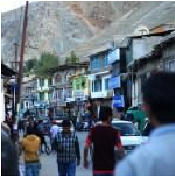
Busy Main Road Kargil