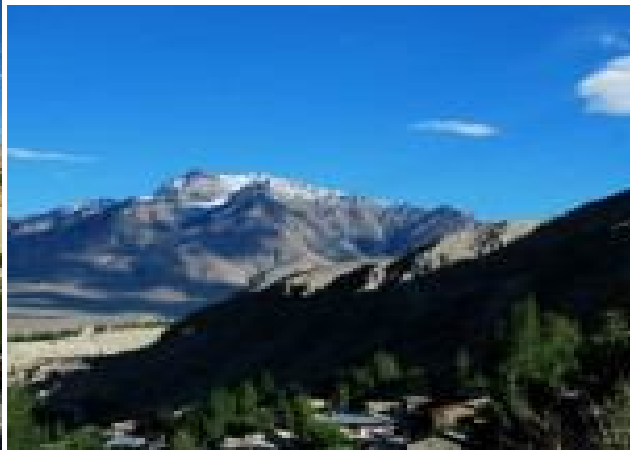
Mountains of Kargil